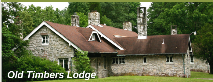
Old Timbers Lodge