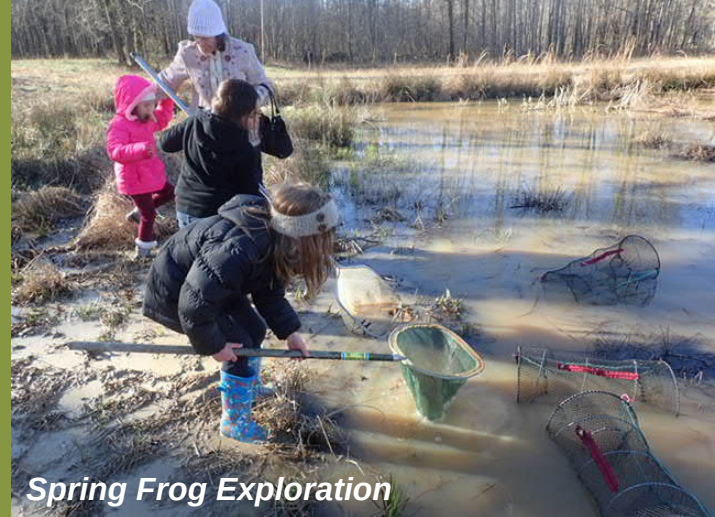
Spring Frog Exploration

BOCS is a non-profit friends group of the Big Oaks National Wildlife Refuge. We work closely with the refuge in their efforts to educate and support visitors about its wildlife and natural habitats. We support the goals of wildlife conservation and habitat restoration at the refuge to enhance awareness of the refuge through education and public-use of its facilities.