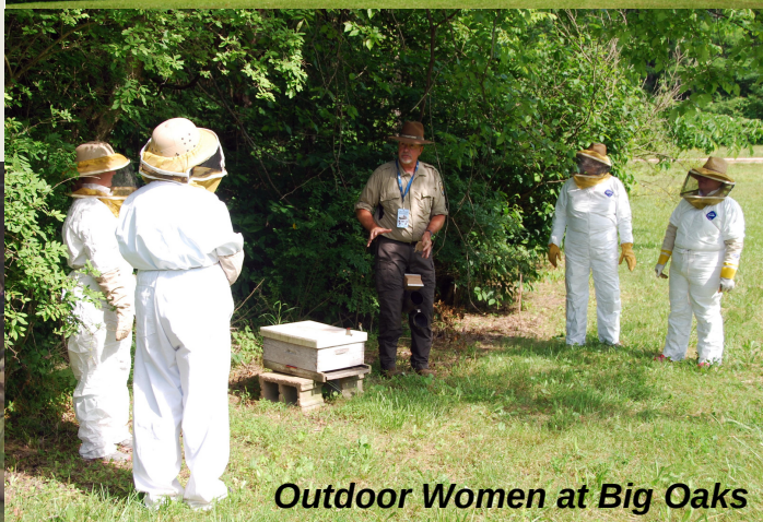
Outdoor Women at Big Oaks