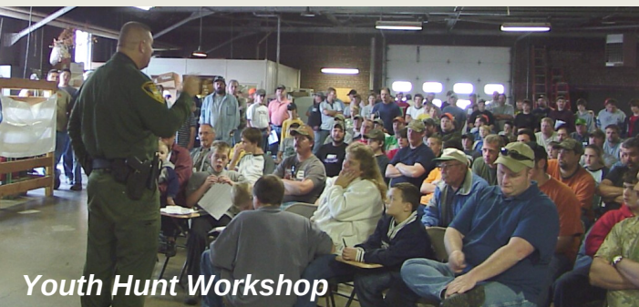
Youth Hunt Workshop